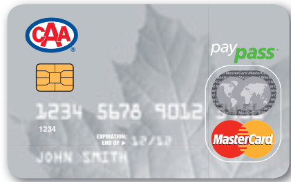
CAA No Fee MasterCard®*