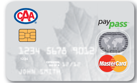
CAA Low Rate MasterCard®*