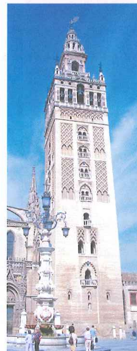
Seville Cathedral, Spain

PLEASE SEE REVERSE FOR THE TOUR ITINERARY >>>