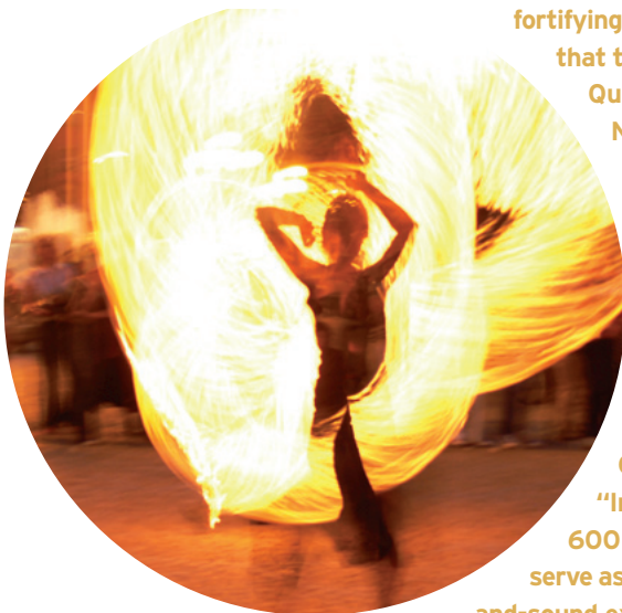
(left) Cirque du Soleil exclusive show for the festivities on October 19 caption here t come caption to come here caption , (right) The late 19th century Chateau Frontenac Hotel looms over smaller stone buildings in Quebec's Old Town caption here.