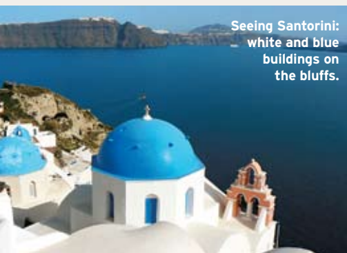
Seeing Santorini: white and blue buildings on the bluffs.