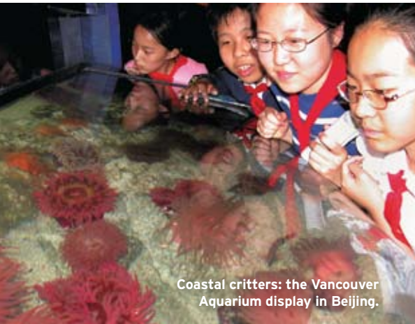
Coastal critters: the Vancouver Aquarium display in Beijing.