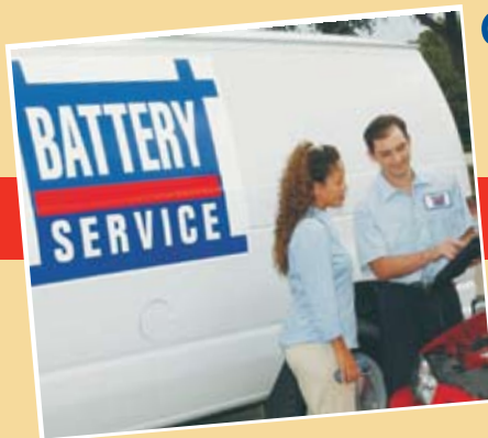
*Battery Assist available in Regina and Saskatoon