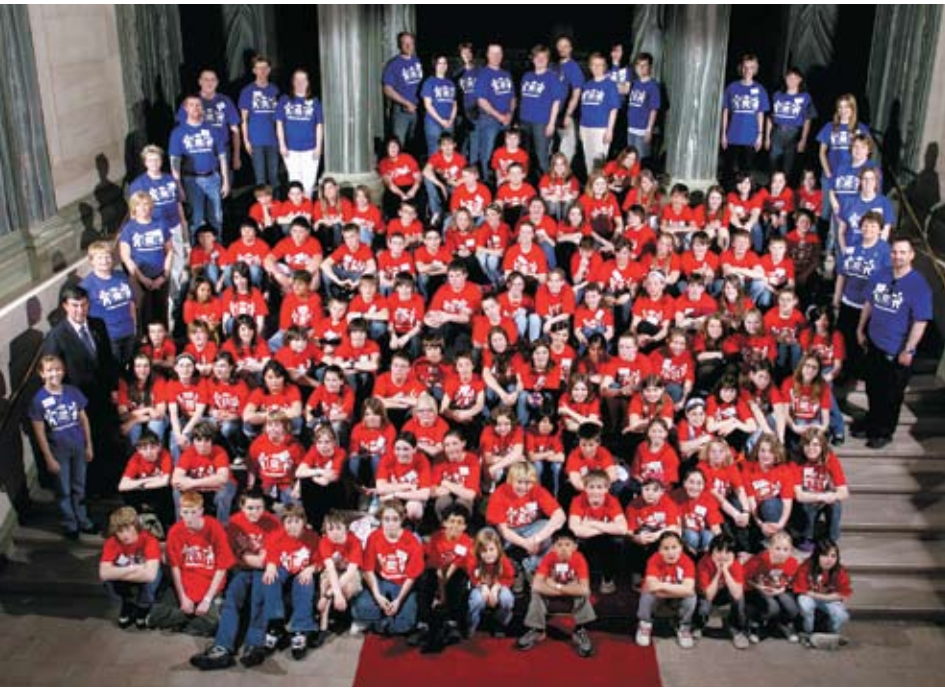
2008 School Safety Patrol Jamboree: Some 150 patrollers and their chaperones gather inside Regina's Legislative Building at the 18th annual jamboree.

an annual School Safety Patrol Jamboree (now in its 18th year) in conjunction with the Provincial School Safety Patrol Week. Held every May in Regina to thank Saskatchewan patrollers for their important work, the jamboree is attended by approximately