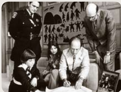
School safety patrollers in the 1960s are congratulated by Prime Minister Pierre Trudeau.