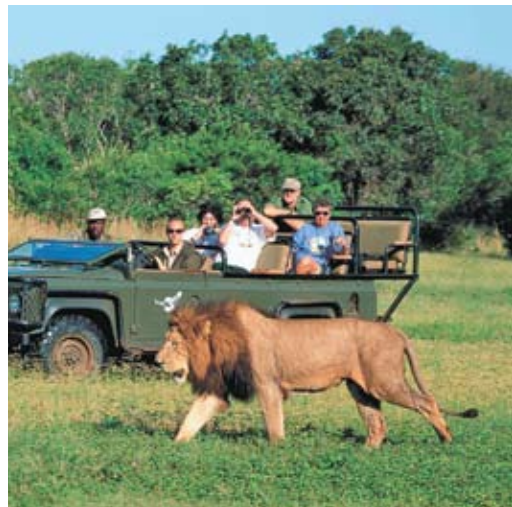
Tourists spot one of South Africa's Big Five during a safari game drive.

Collette Vacations offers a wide variety of tours, with an exciting range of destinations to satisfy differing tastes in travel. CAA is pleased to join Collette on February 18, 2010 , for an exclusive group departure to spectacular South Africa . Search for the Big Five (elephant, Cape buffalo, rhinoceros, lion and leopard) during safari game drives. Visit a working ostrich farm, a local vineyard, Table Mountain and Cape Point. Ask us about the Victoria-Falls-in-Zambia extension. Seats are limited, so call today.