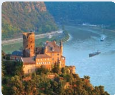
Germany's Burg Katz castle overlooks the Rhine River.

My adventure began in Basel, Switzerland. After a day of exploring, it was time to settle into my "floating hotel." We travelled on the legendary Rhine and Main rivers with stops in Strasbourg, Speyer, Heidelberg, Rudesheim, Aschaffenburg, Miltenberg, Würzburg, Bamberg and Nuremberg. Highlights included Aschaffenburg's 1,000 years of history and the UNESCO World Heritage Site of Bamberg, an architectural gem spread across seven hills in the heart of Northern Bavaria. Heidelberg is one of the best-preserved medieval cities in Europe; in Rudesheim, a gondola ride took us to the Niederwald monument, which depicts the